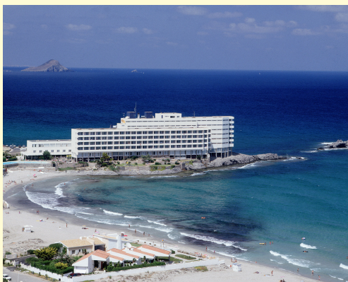
HOTEL SOL GALÚA La Manga del Mar Menor, Murcia (Spain)